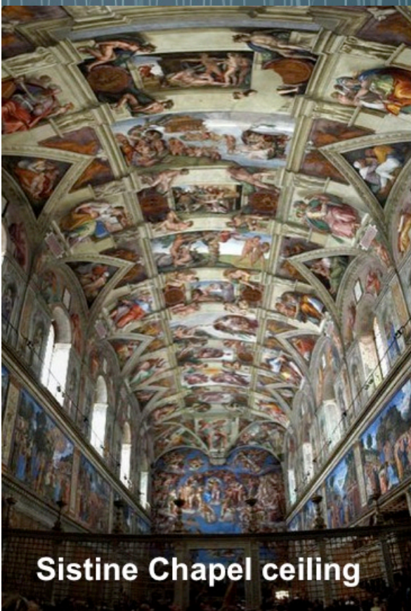
Sistine Chapel ceiling

With the feasts that were given to Israel God was painting a picture of the Gospel