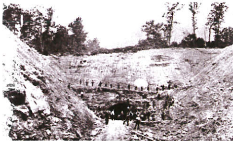
Build the first highway

Consider this – Is it easier to build a new highway spanning across the wilderness, tunneling through mountains, constructing bridges over rivers and arriving at the correct destination or is it easier to maintain that highway once it is built?