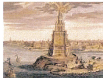
Alexandria (Largest Library)