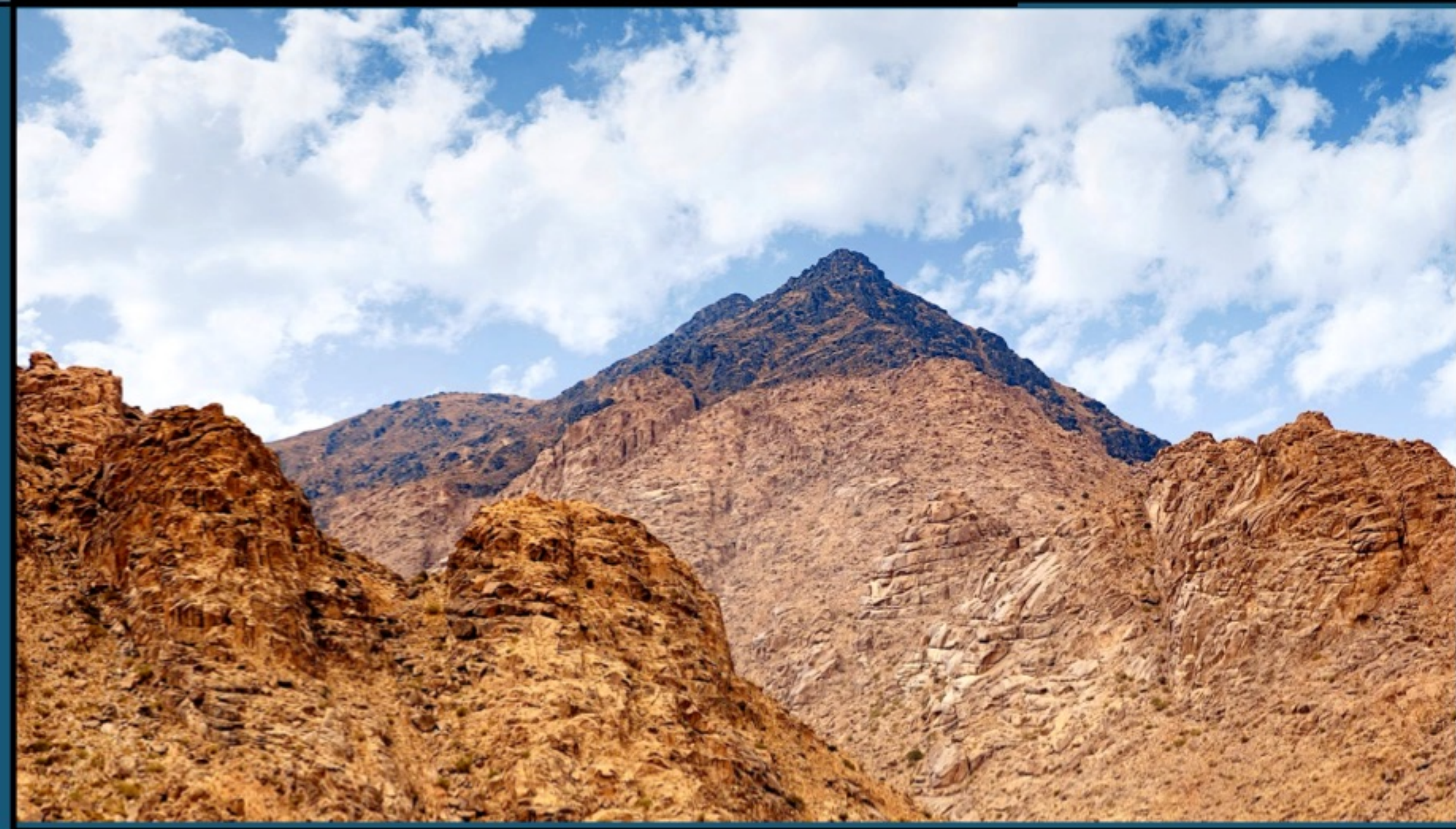
Egypt, Red Sea, Mt. Horeb