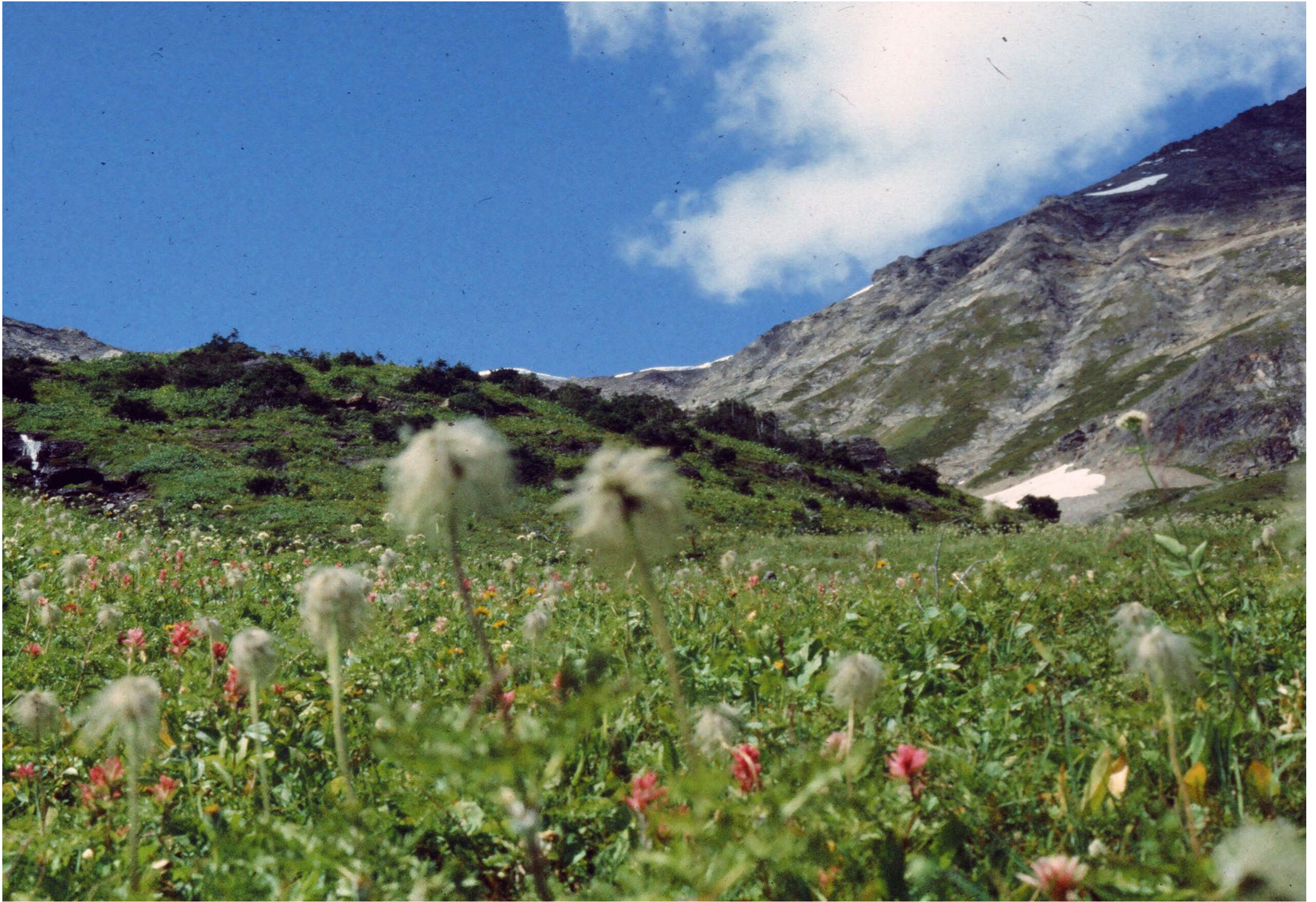
Mt. Rainier