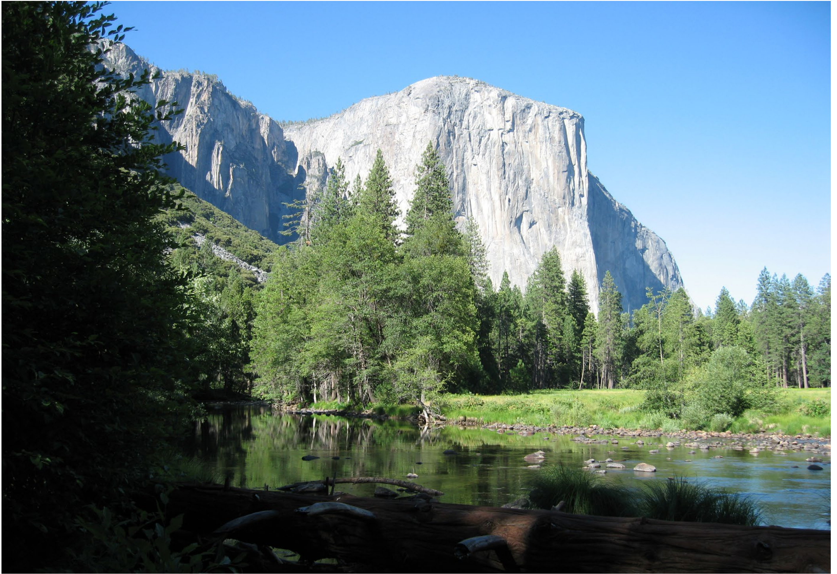
El Capitan, Yosemite National Park