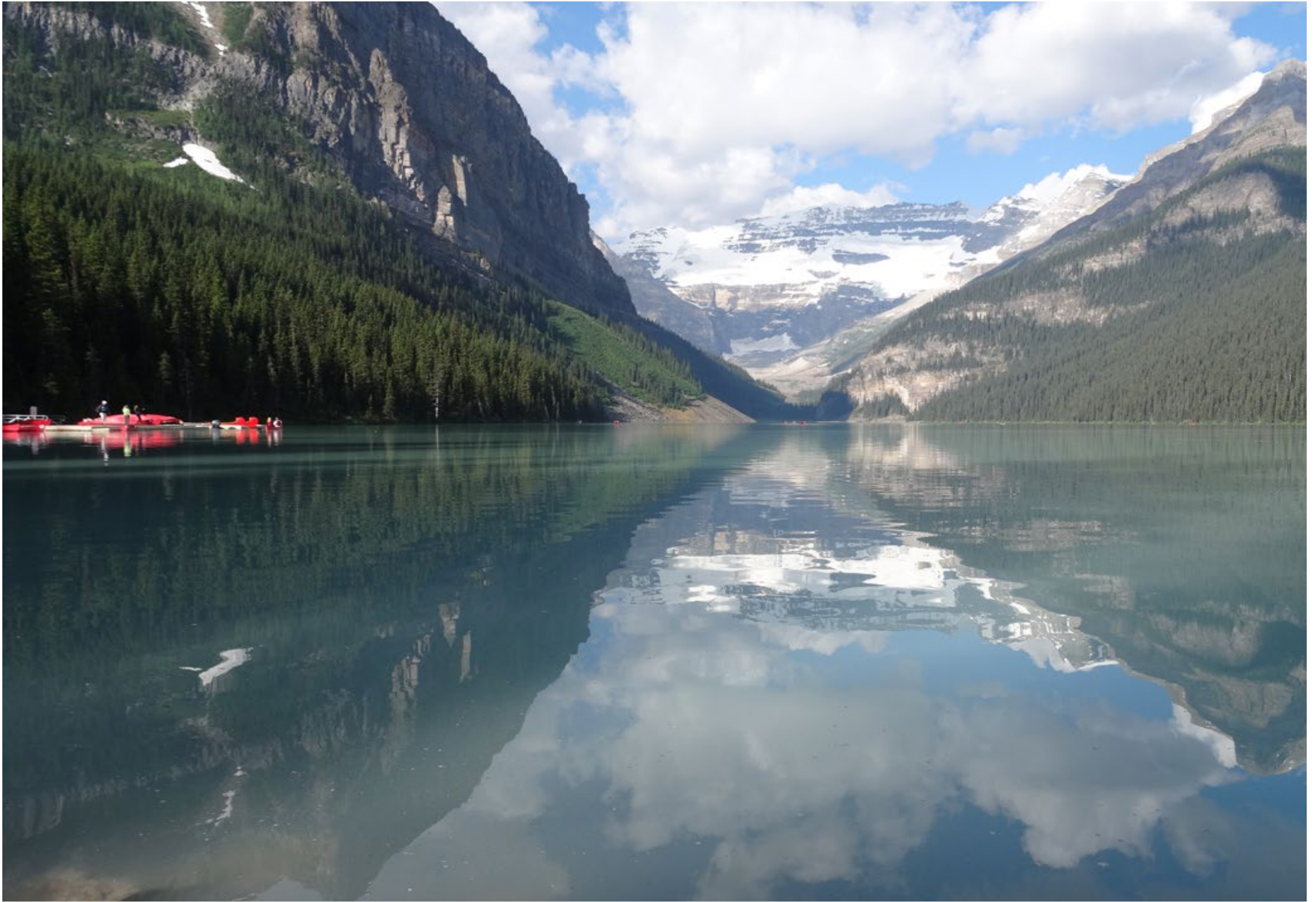
Lake Louise, Banff Nat'l Park, Alberta