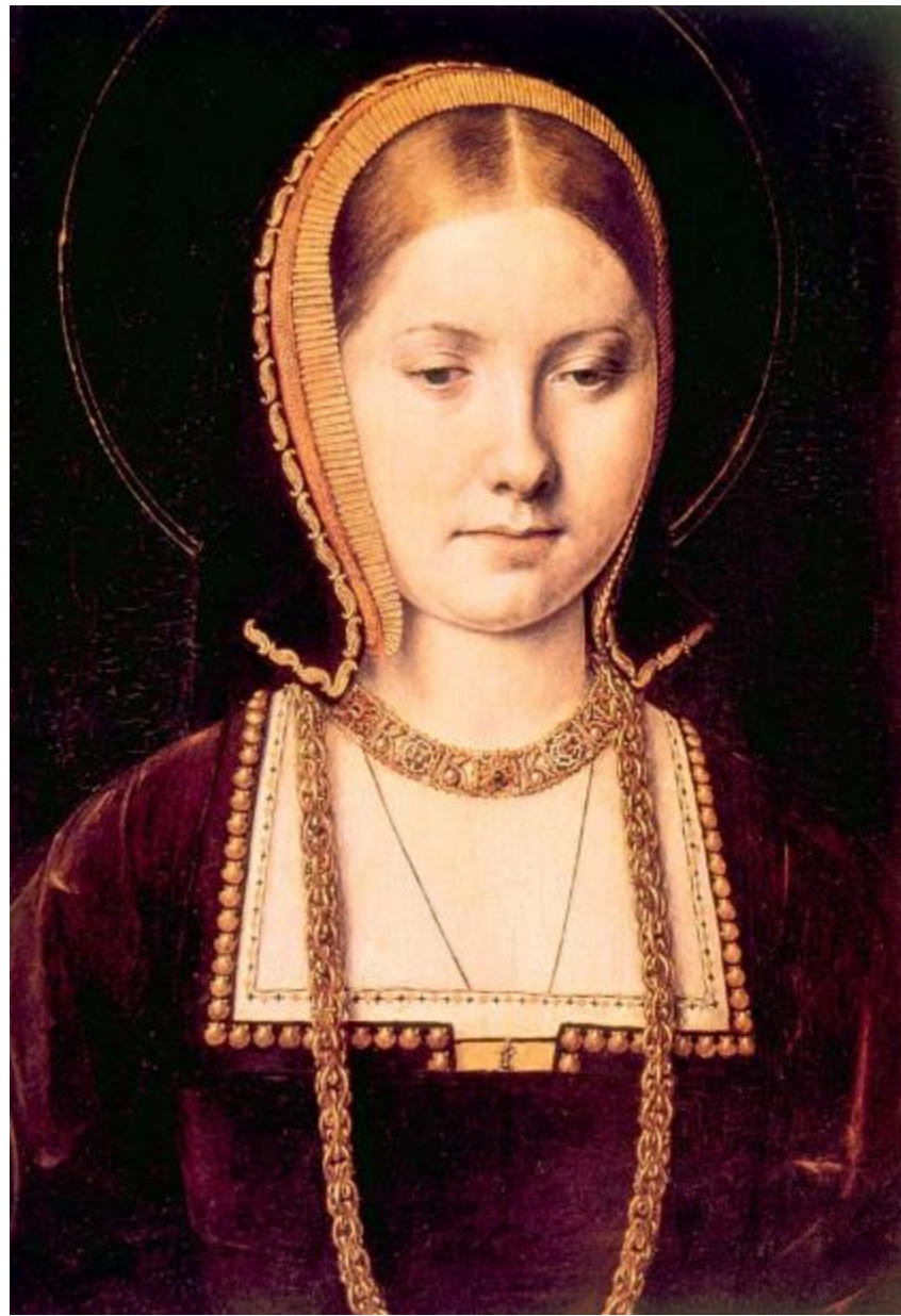
Catherine of Aragon Henry's 1 st wife