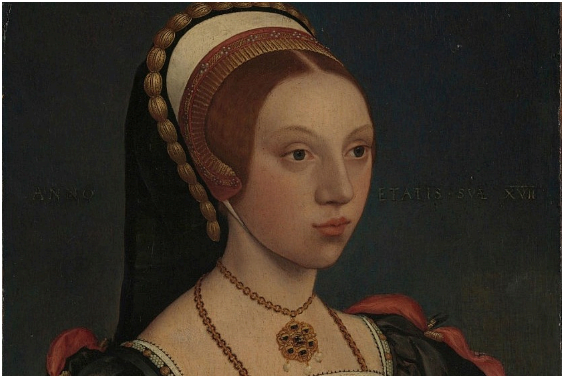
Catherine Howard Henry's 5 th Wife