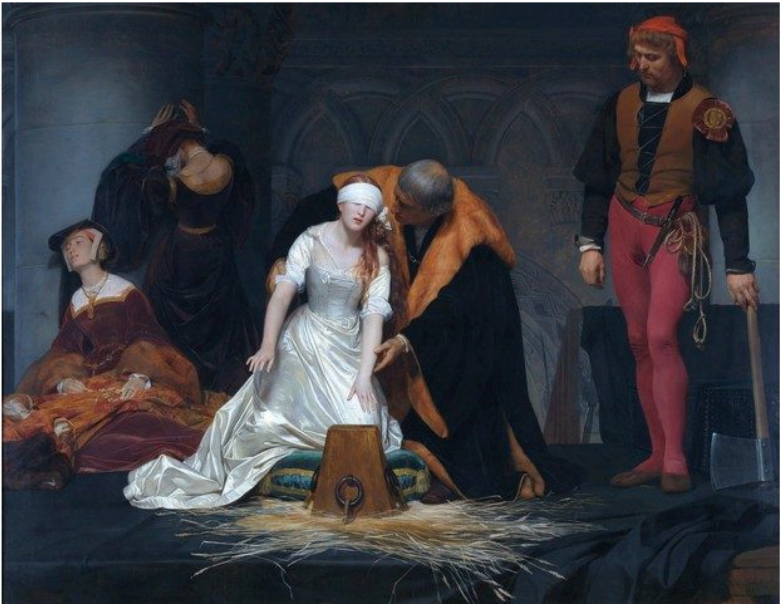
Lady Jane Grey