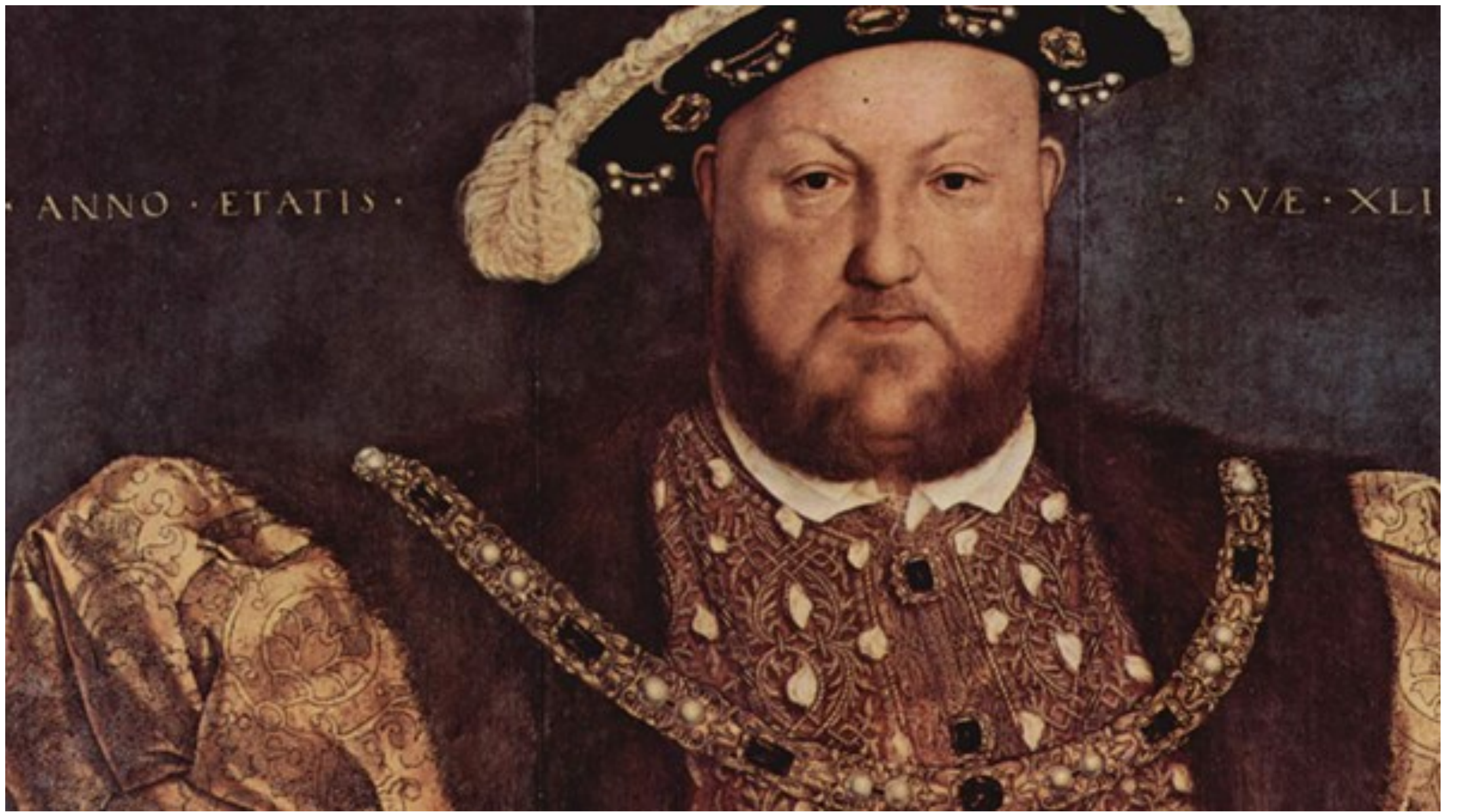
King Henry VIII