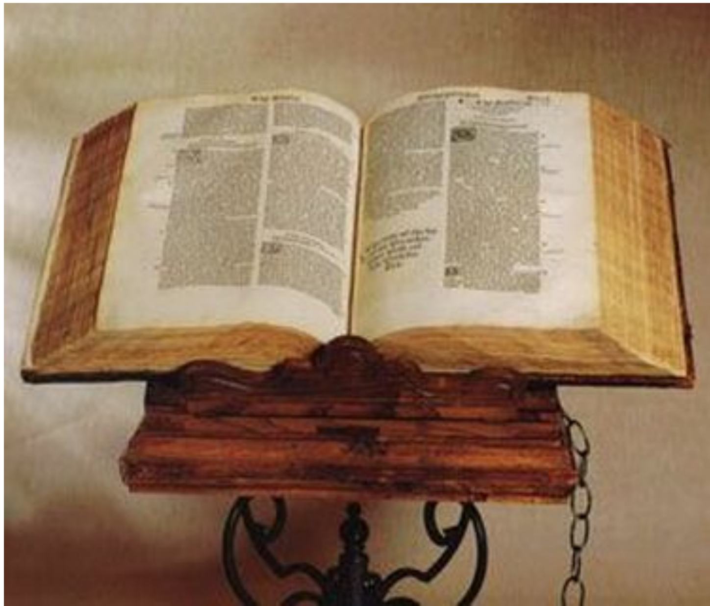
The "Great" Bible of 1539