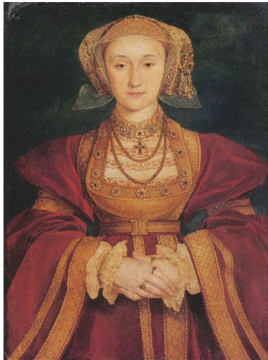
Anne of Cleves Henry's 4 th Wife