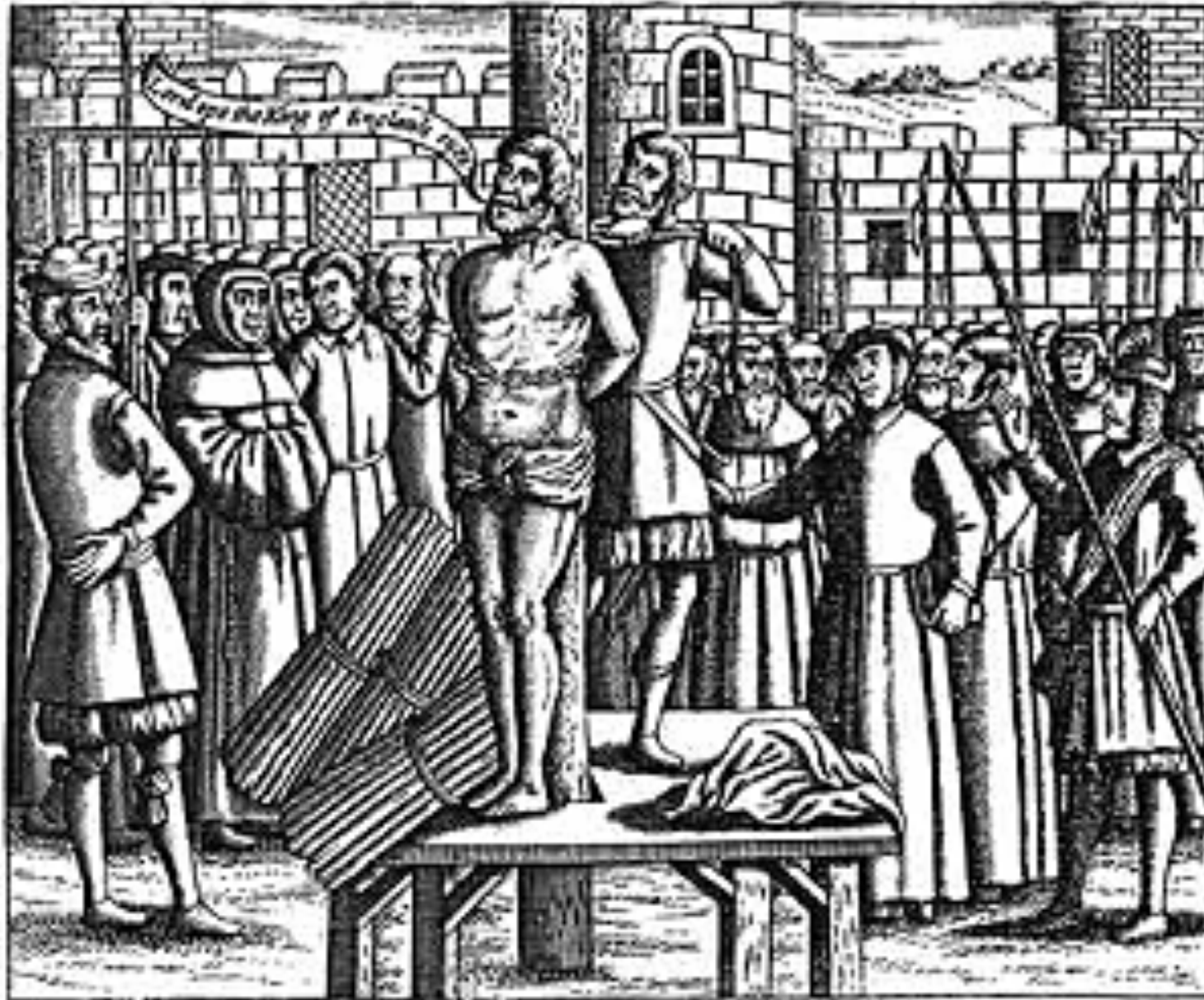
William Tyndale Execution