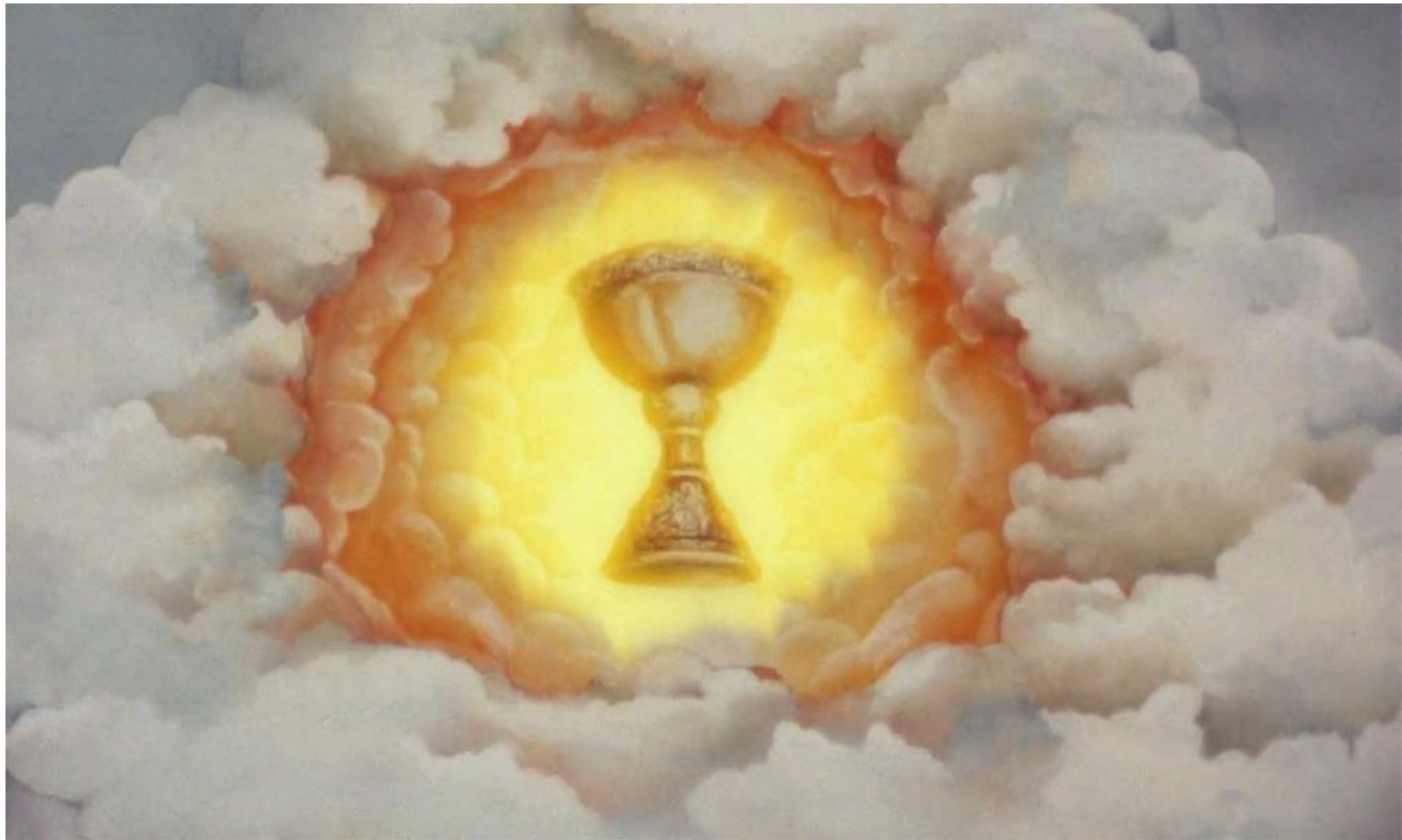
The Holy Grail