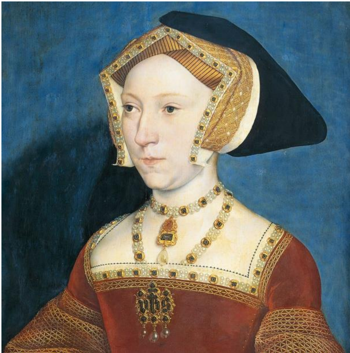
Jane Seymour Henry's 3 rd Wife