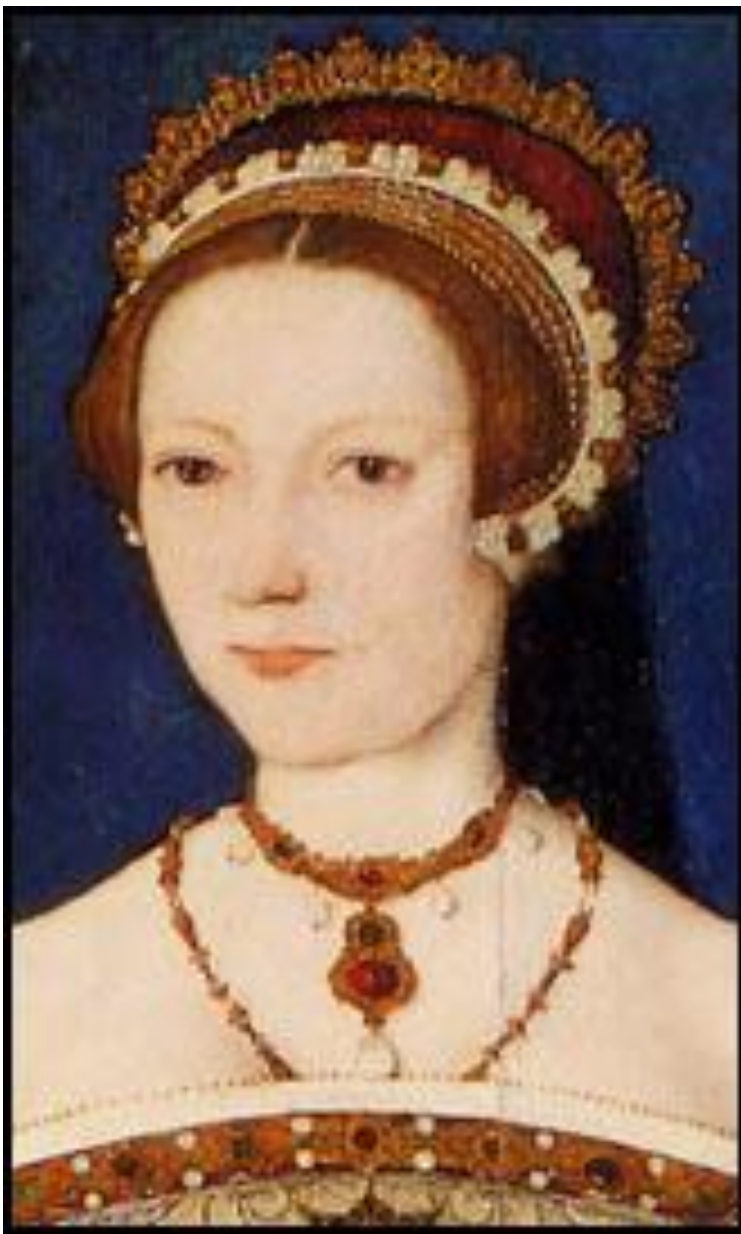
Lady Jane Grey Queen for 9 days!