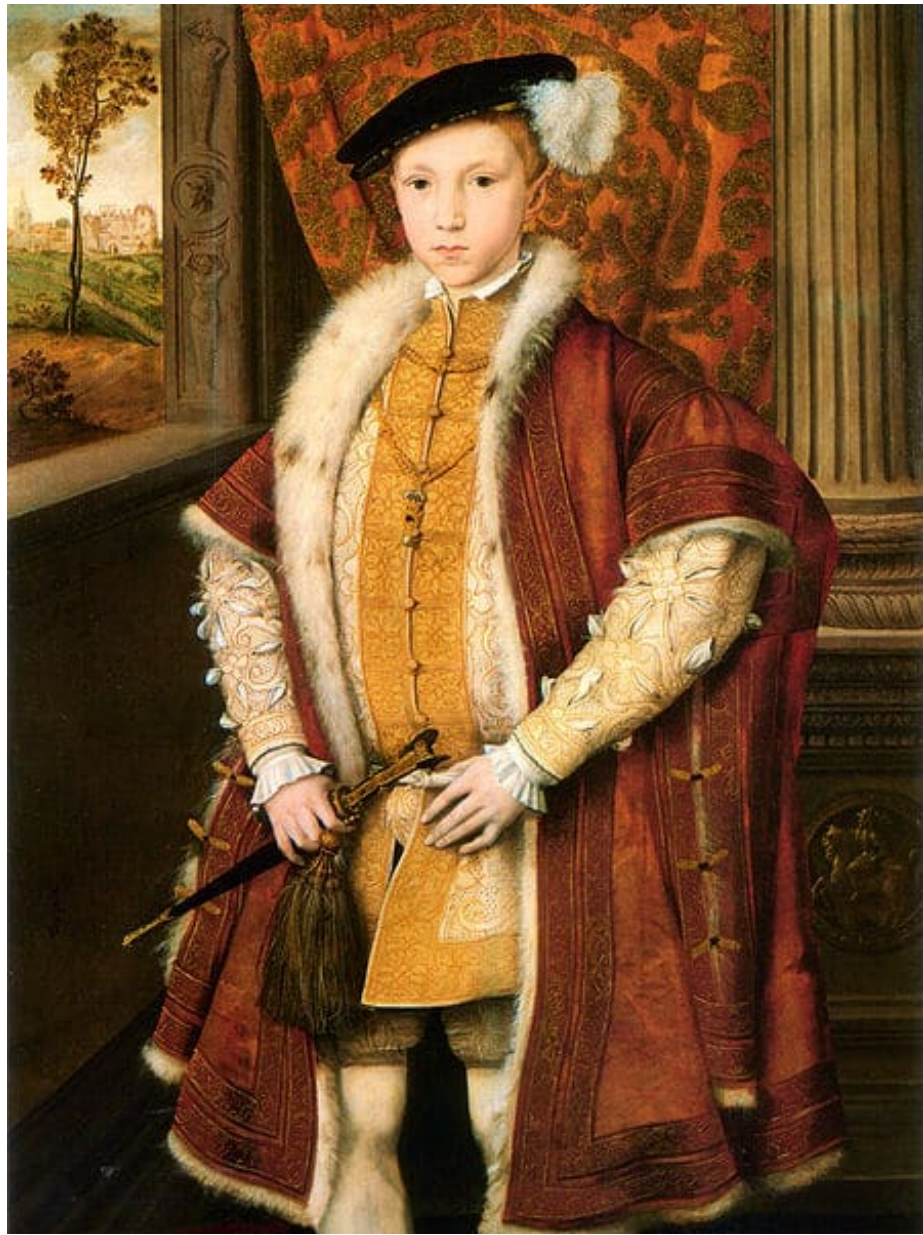
King Edward VI Son of Henry VIII