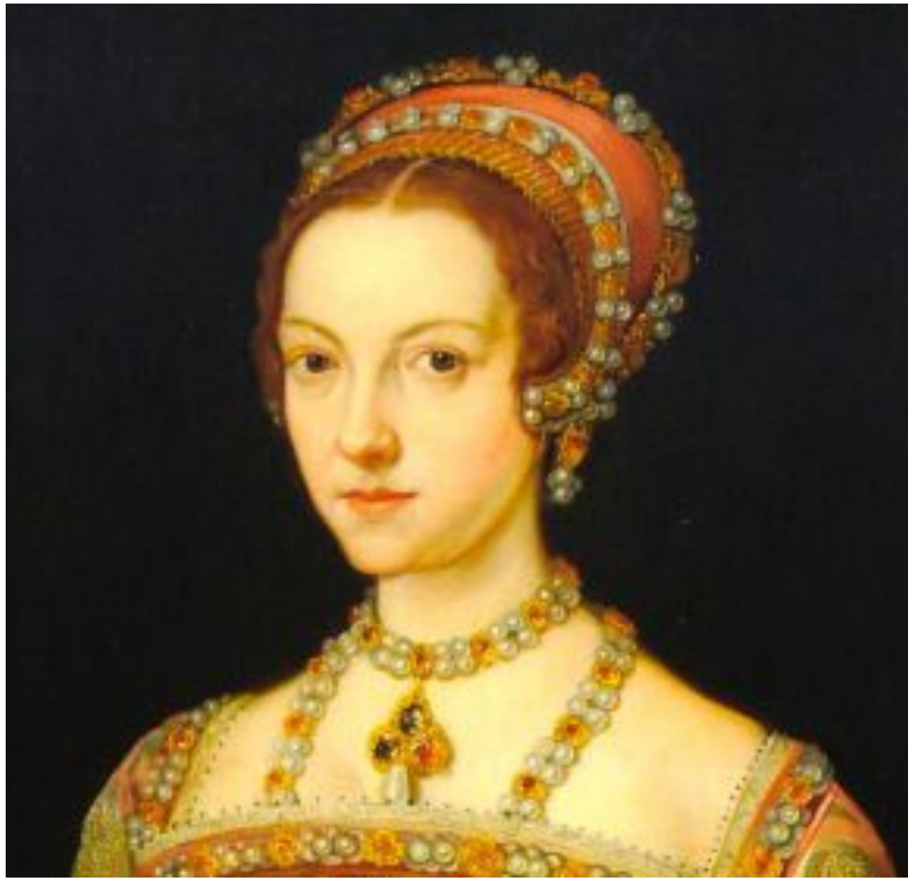
Catherine Parr Henry's 6 th Wife