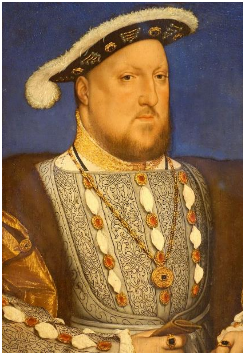
King Henry VIII