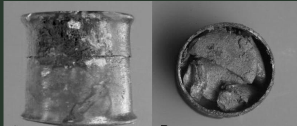
Famous Medical School (eye salve)