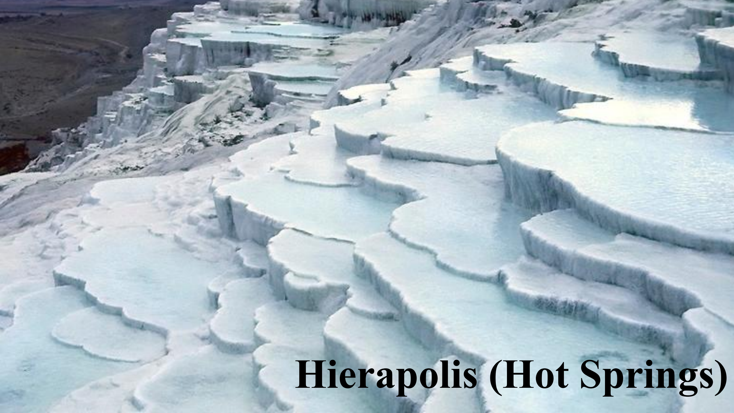
Hierapolis (Hot Springs)