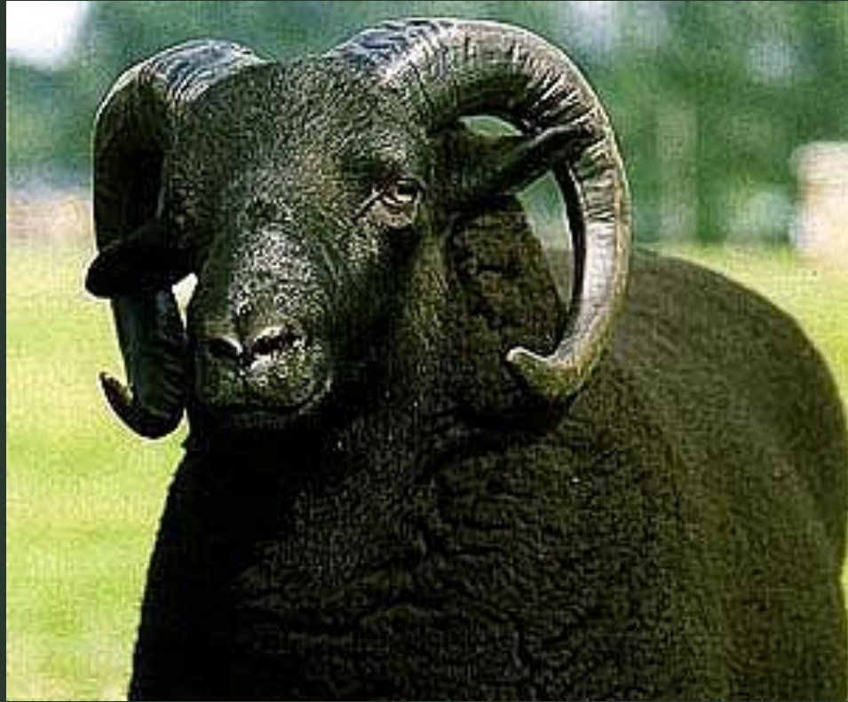
Clothing Industry (black wool)