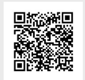
Digital Connect Card

*Please place offerings and connect cards in the communication boxes on the walls as you exit the Worship Center