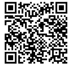
Digital Connect Card

*Please place offerings and connect cards in the communication boxes on the walls as you exit the Worship Center