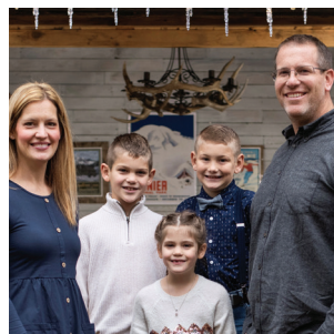
The Prestwich Family