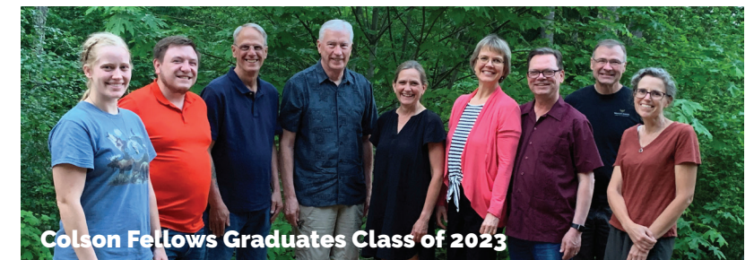
Colson Fellows Graduates Class of 2023

I highly recommend the Colson program to anyone who seeks to understand and live biblically in today's culture.