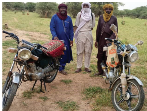
In 2023, the LC3 family donated money to purchase two motorcycles (pictured) to support evangelists.

To learn more please read the Tamajaq/Fulani brochure at the Missions Counter.