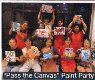
"Pass the Canvas" Paint Party