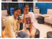
Lunch on Campus