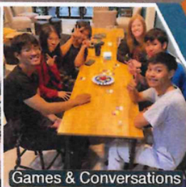
Games & Conversations