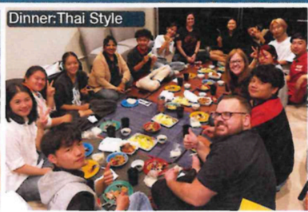
Dinner: Thai Style