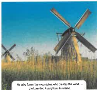
He who forms the mountains, who creates the wind, ... the Lord God Almighty is his name. AMOS 4:13

The April-June Edition of the devotional "Our Daily Bread" is available on the tables at the back of the Sanctuary and in the foyer. Be sure to pick up your copy today!