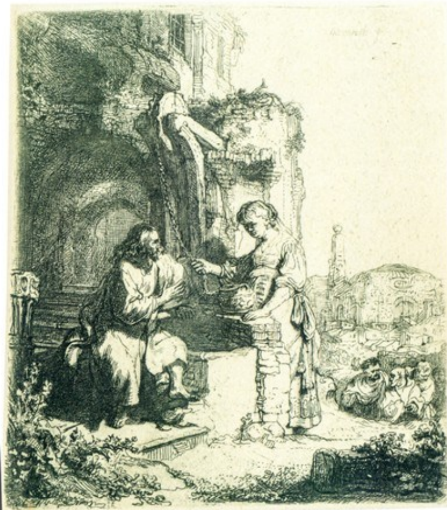
Image Credits: Rembrandt Harmenszoon van Rijn, 1606-1669. Christ and the Woman of Samaria, Among Ruins, from Art in the Christian Tradition, a project of the Vanderbilt Divinity Library, Nashville, TN. https://diglib.library.vanderbilt.edu/act-imagelink.pl?RC=573.02 . Original source: https://commons.wikimedia.org/wiki/File:Christ_and_the_Samaritan_Woman_among_Ruins.jpg .