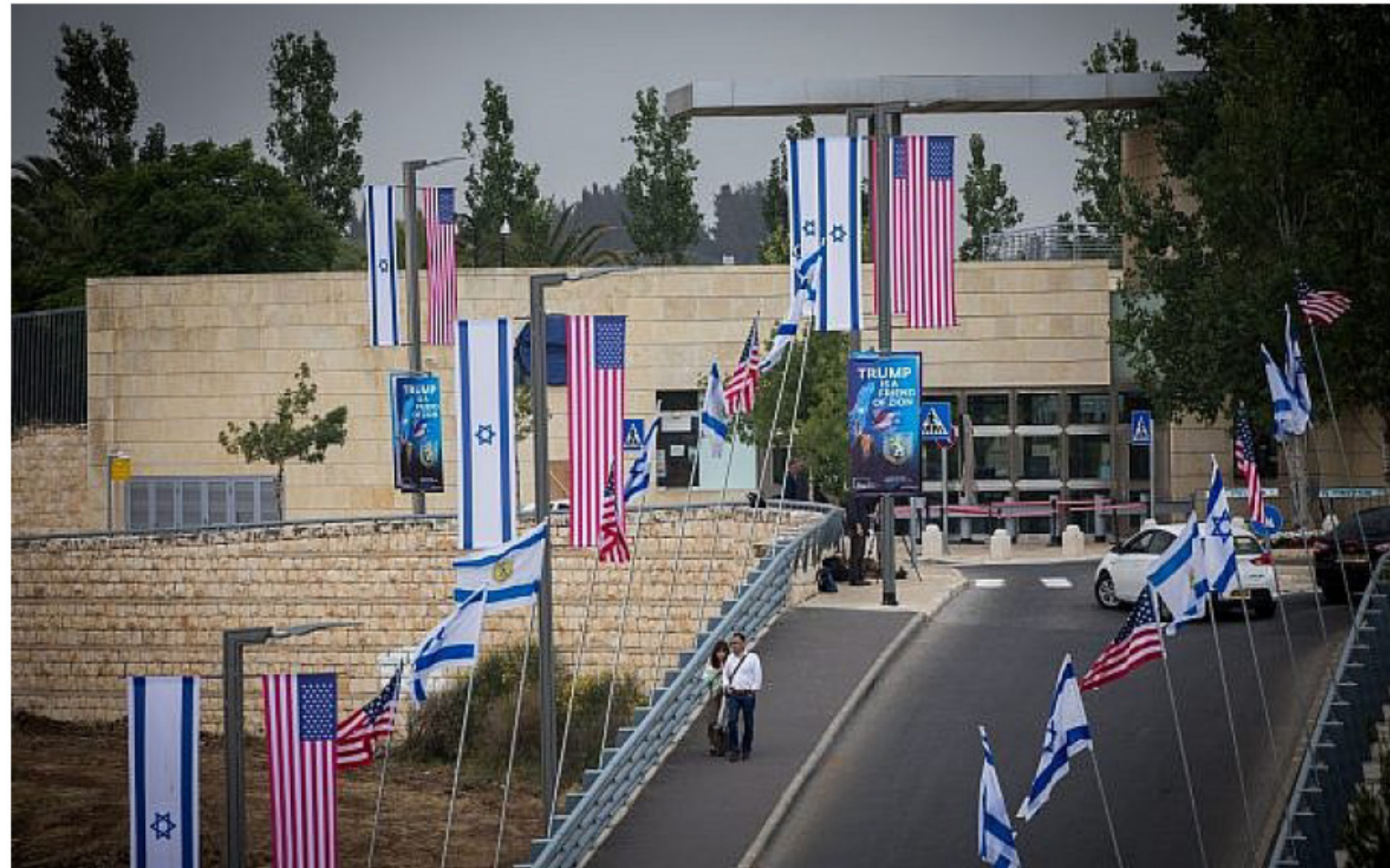
View of the site of the US Embassy in Jerusalem ahead of its inauguration, May 13, 2018.

The US Senate voted overwhelmingly Thursday to keep the United States Embassy in Jerusalem, with only three senators voting against establishing funding to maintain the diplomatic mission.