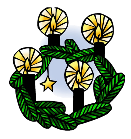
Gathering + Word + Meal + Sending

St. Mark's Lutheran Church, 2323 Las Lomitas Drive, Hacienda Heights, CA, 91745