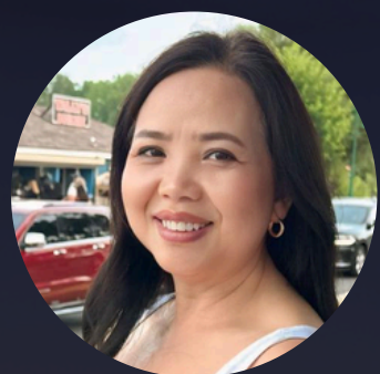
N. TXAWJ YIS HAWJ