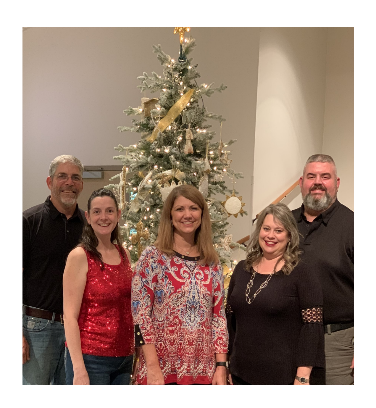
May the GOD OF HOPE fill you with all JOY and PEACE

as you trust in Him so that you may over flow with hope by the