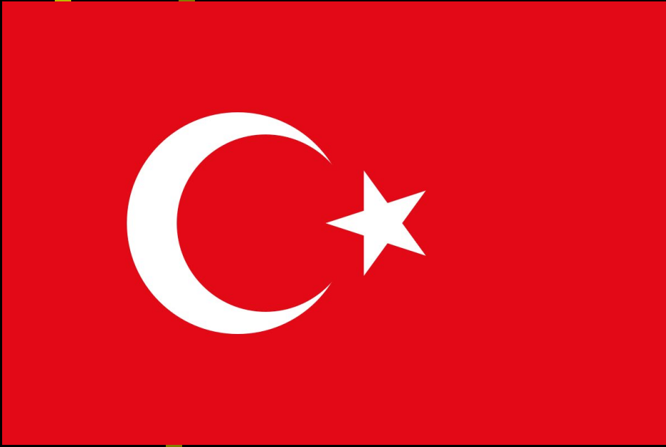
Flag of Turkey