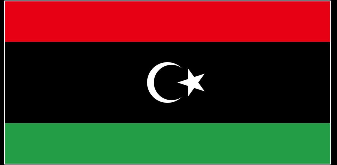
Flag of Libya

Four horsemen of the Apocalypse (Rev 6:2-8): Conquest – White; War – Red; Famine – Black; Death – Pale Green