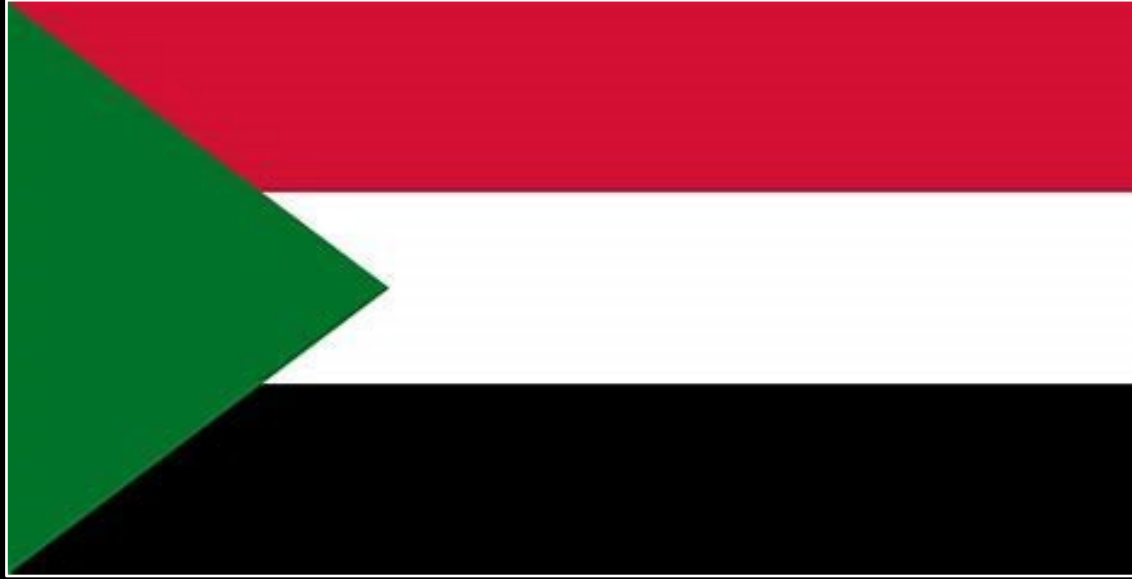
Flag of Sudan