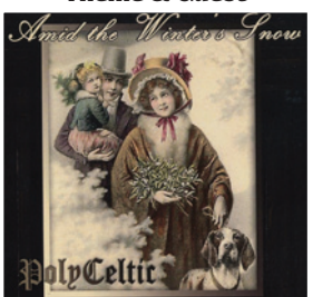
Theme & Guest

"Come now, and let us reason together, saith the LORD: though your sins be as scarlet, they shall be as white as snow; though they be red like crimson, they shall be as wool." Isaiah 1:18 [KJV]