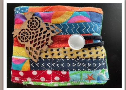
Prizes were awarded to winners of “Who Do You Know?” Bingo. This handmade sewing kit is a treasure.

The retreat ended with the video “God Knows Your Name.” The lyrics and images filled me with love for my Lord. Jeremiah 1:5 ESV “Before I formed you in the womb, I knew you, and before you were born I consecrated you; I appointed you a prophet to the nations.” Just like the great prophet Jeremiah, God knows