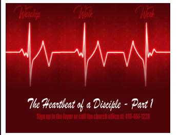
Worship | Walk | Work