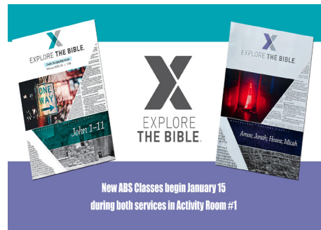
New ABS Classes begin January 15 during both services in Activity Room #1

Middle & High School students will begin a new Bible study on the Gospel of John Beginning January 15 at 9 am. This is the perfect opportunity to get your teen involved in Youth Group!