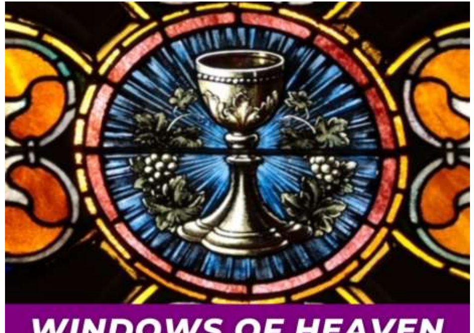
WINDOWS OF HEAVEN 11AM Worship - March 5, 2023

Sunday, March 5, 2023 11:00am 2nd Sunday in Lent