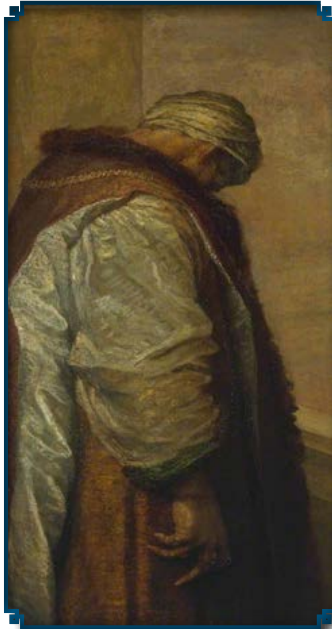
"For He Had Great Possessions" by George Frederick Watts, British painter