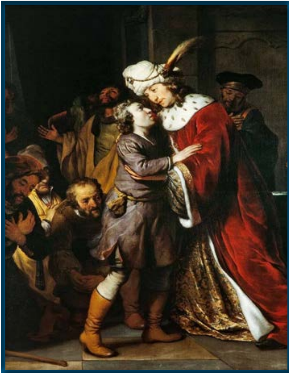
“Joseph and his Brothers “

by Dutch Golden Age painter, Gerbrand van den Eeckhout (1621-1674) Skokloster Castle Skokloster, Sweden