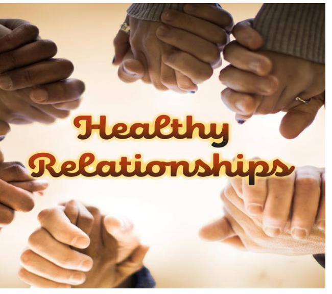
Sunday, July 22, 2018

Making Disciples of Jesus Christ and Changing the World