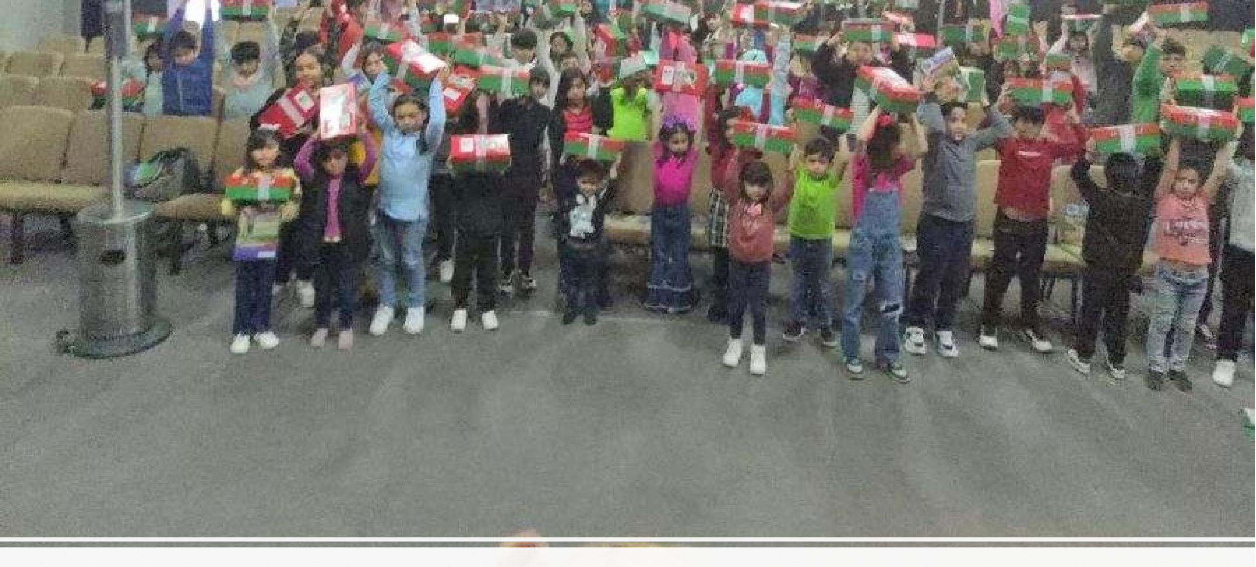
HPC Missions – Agua Prieta