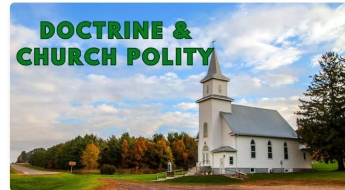
Doctrine & Church Polity