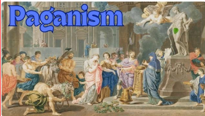
Paganism & Christianity