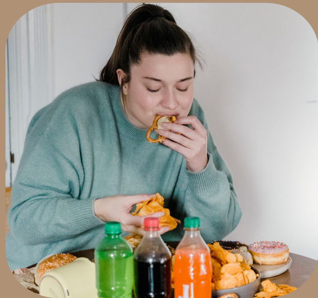
Desires of the flesh

“For all that is in the world- the desires of the flesh and the desires of the eyes and the pride of life- is not from the Father but is from the world.” (ESV)