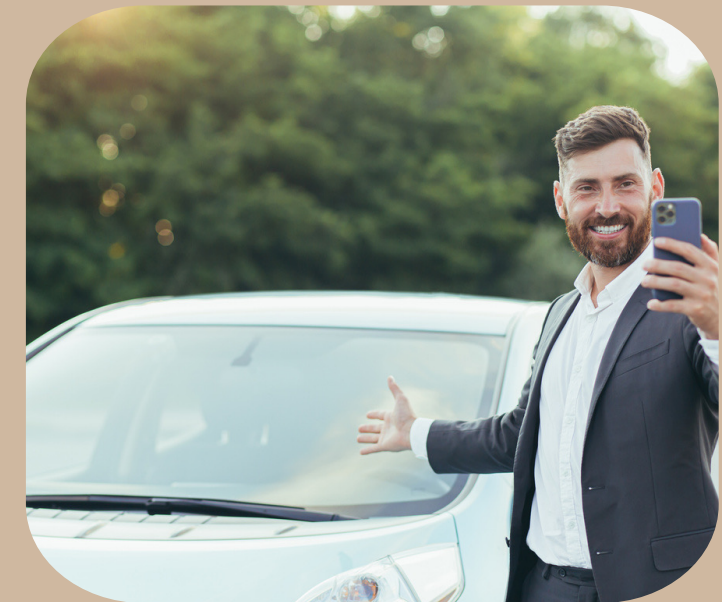
Pride of Life