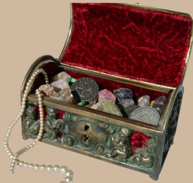
Desires of the eyes