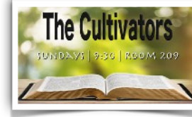
The Cultivators (Room 209)