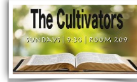
The Cultivators (Room 209)