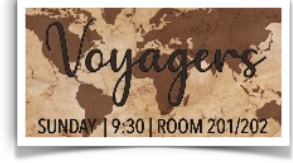
The Voyagers (Room 202)