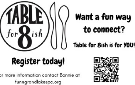
Table for 8ish

Come for a night filled with bowling and fun at Times Square Entertainment! $10/person - sign up in the GLPC app!