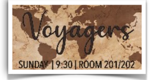
The Voyagers (Room 202)