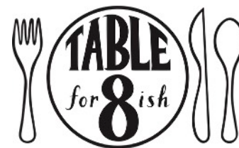
Table for 8-ish!

We hope all of our Table for 8-ish groups are up and going. We hope you are looking forward to your group's next gathering!