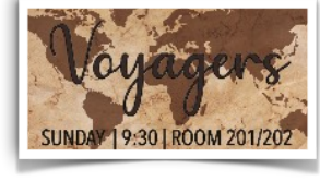
The Voyagers (Room 202)