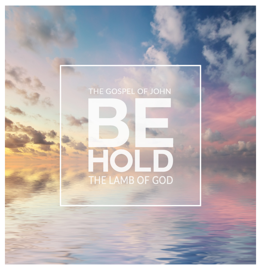
July 9, 2017 :: Summer One Sunday Service :: 10:00AM