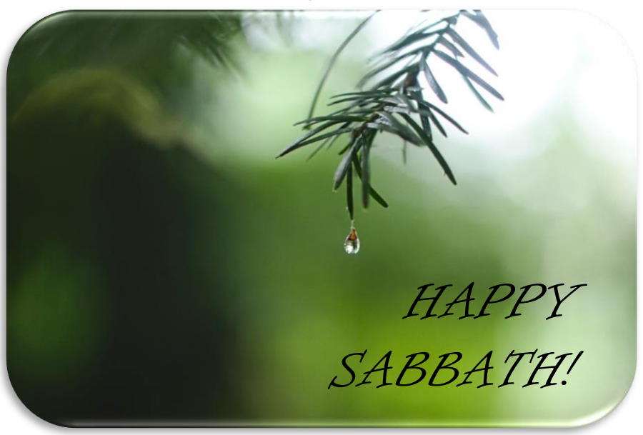
Worship Service ~ 11:00 AM