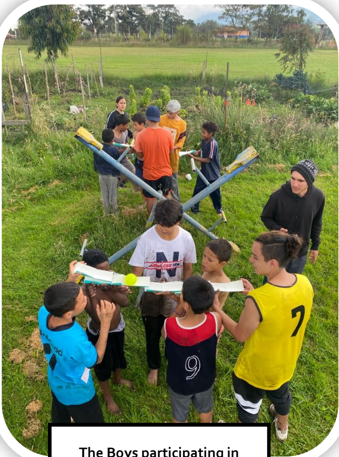
The Boys participating in activities at the summer camp

There have been many children grow up on the farm as the years have passed. Some boys finished well, departing at a good time and are now living fruitful lives. Others left prematurely or did not wish to change and were lost to the world and the environment we tried to rescue them from. When I see the faces of the boys we have now, having fun, playing soccer, eating healthy, and knowing they are able to grow up in a safe environment it is easy to get emotional. Just knowing the situations we are rescuing them from and allowing them a place where they can heal from the pain and trauma they have had to experience in their short lives. It is such a privilege to be able to care for these young boys and we want to thank you for being part of it. Thank you for praying and donating and helping to give these boys an opportunity for a different life, an opportunity to learn about the gospel and if they desire to make a life with Jesus.