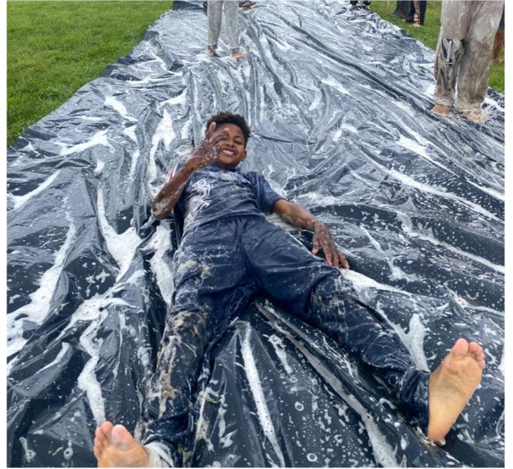
Fun with the Slip and Slide!