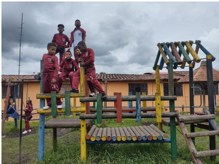
The Boys at the school playground

The Colombia economy has been affected adversely due to the decrease in the supplies just as in other parts of the world. These economic shock waves are felt even in the dairy capital in San Pedro. Currently, feed and cattle prices are 36% higher. The Open Arms foundation is going to have to leave the small cheese factory which has been buying our milk for the last 25 months in order to find a Milk corporation which is paying more for milk. We are currently being paid $1,350 COP per liter, but we need a company that can give us an increase up to $1,500 Cop Per liter. Please pray that we can find such a blessing.