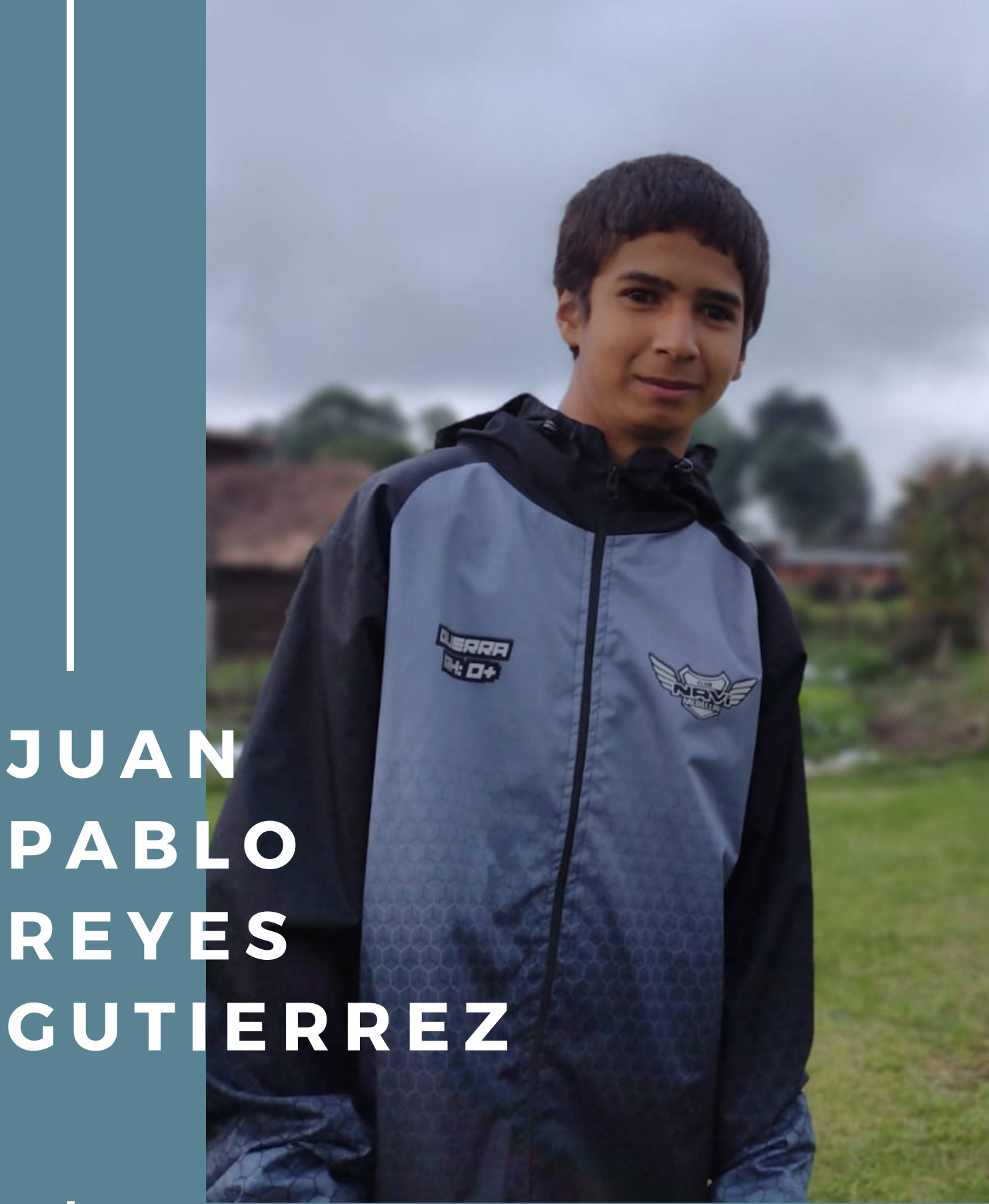
14 YEARS OLD