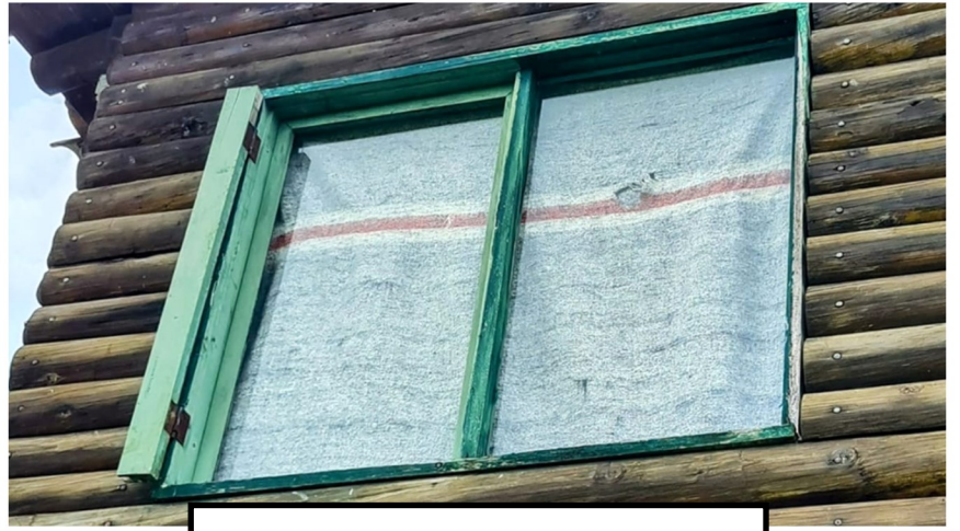
Cabin Window That Needs Replaced

Thank you for taking the time to read our newsletter and we greatly appreciate your continuing prayer and support. God Bless!