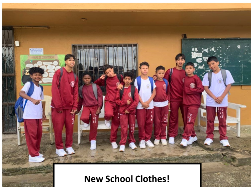
New School Clothes!

Another praise report is that in spite of a yearlong battle with la Nina (abnormally high amounts of rainfall) high inflation in feed and fertilizer; the dairy farm had a gross income of 37,178. The net gain was low (3,766) because the profit from the dairy went to pay for