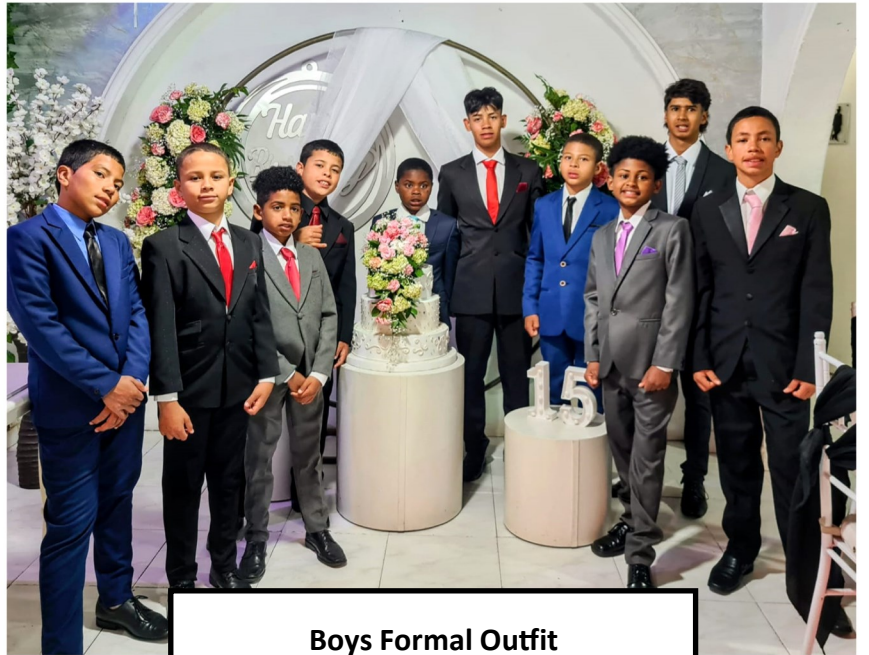
Boys Formal Outfit