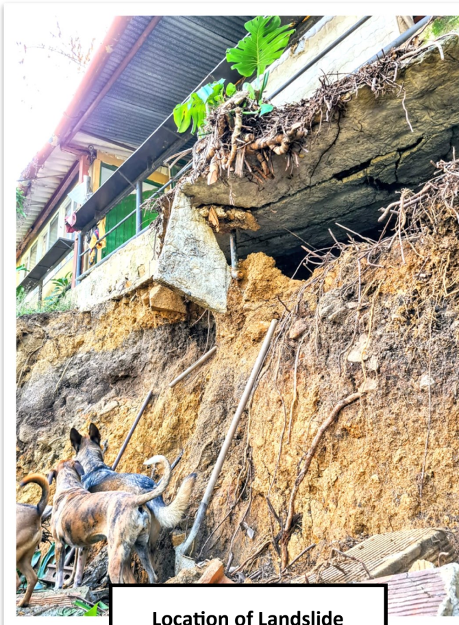
Location of Landslide

This process is complicated by the neighbors who make agreements on the property boundaries only to change their minds within days. Because of this uncertainty it is impossible to run lines for construction; therefore, we are going to have to seek the municipal government as a neutral mediator. This is going to create even more problems because our neighbors can become quite hostile. They most certainly will not like the threat of being fined by the government because of their