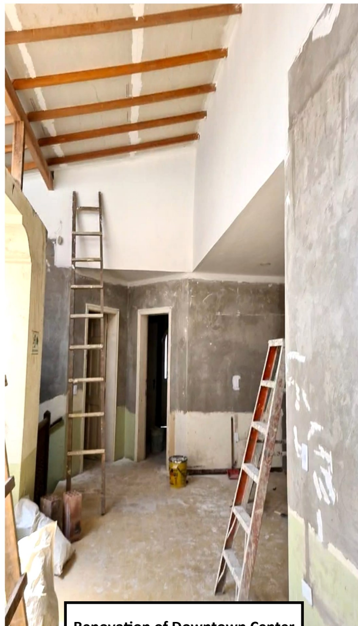
Renovation of Downtown Center

What is it that gives us a sense of security and wellbeing in our lives? What are the things that give us emotional and mental support in our personal lives, and substance in our physical existence? What support do we have when our health begins to fail us? What happens when the governments that are supposed to preserve the civil order in society and in our world are in disorder and fail? What happens when the earth gives way beneath us and is suddenly removed? Even though everything that supports us in life is removed God is still our refuge. God is still there to help us in our trouble. Trust God, He is our help in trouble we will not fear.