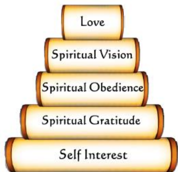
Stages of motivational development in biblical giving

And now, brothers and sisters, we want you to know about the grace that God has given the Macedonian churches. 2 In the midst of a very severe trial, their overflowing joy and their extreme poverty welled up in rich generosity. 3 For I testify that they gave as much as they were able, and even beyond their ability. Entirely on their own, 4 they urgently pleaded with us for the privilege of sharing in this service to the Lord's people. 5 And they exceeded our expectations: They gave themselves first of all to the Lord, and then by the will of God also to us. 6 So we urged Titus, just as he had earlier made a beginning, to bring also to completion this act of grace on your part. 7 But since you excel in everything—in faith, in speech, in knowledge, in complete earnestness and in the love we have kindled in you—see that you also excel in this grace of giving.