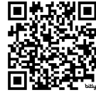
GOSPEL OF MATTHEW