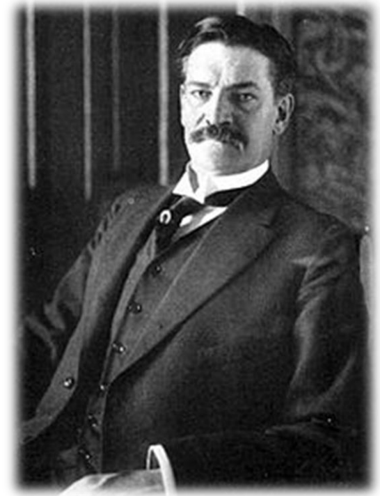
Colonel Archibald Gracie