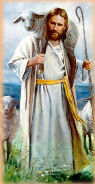
God as Shepherd