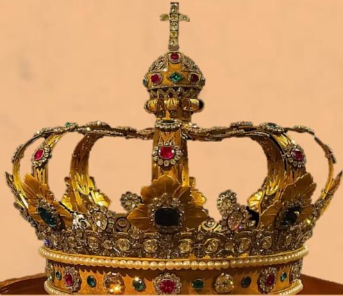
God as King