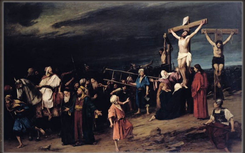
Mihaly Munkacsy's 1884 "Christ On The Cross."

Jesus didn't really die-he recovered and left the tomb