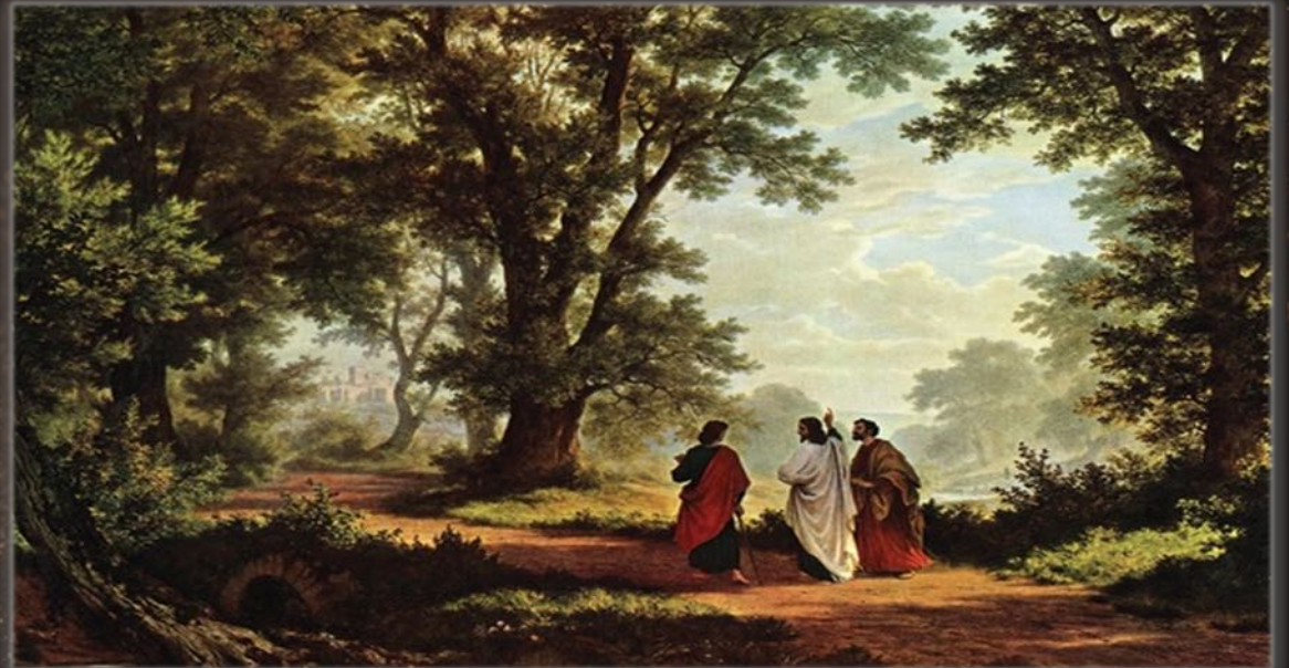
The Road to Emmaus by Robert Zund