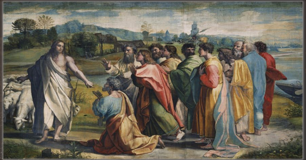
Christ's Charge to Peter by Raphael

“Because I live, you will live too.” - Jesus (John 14:19)