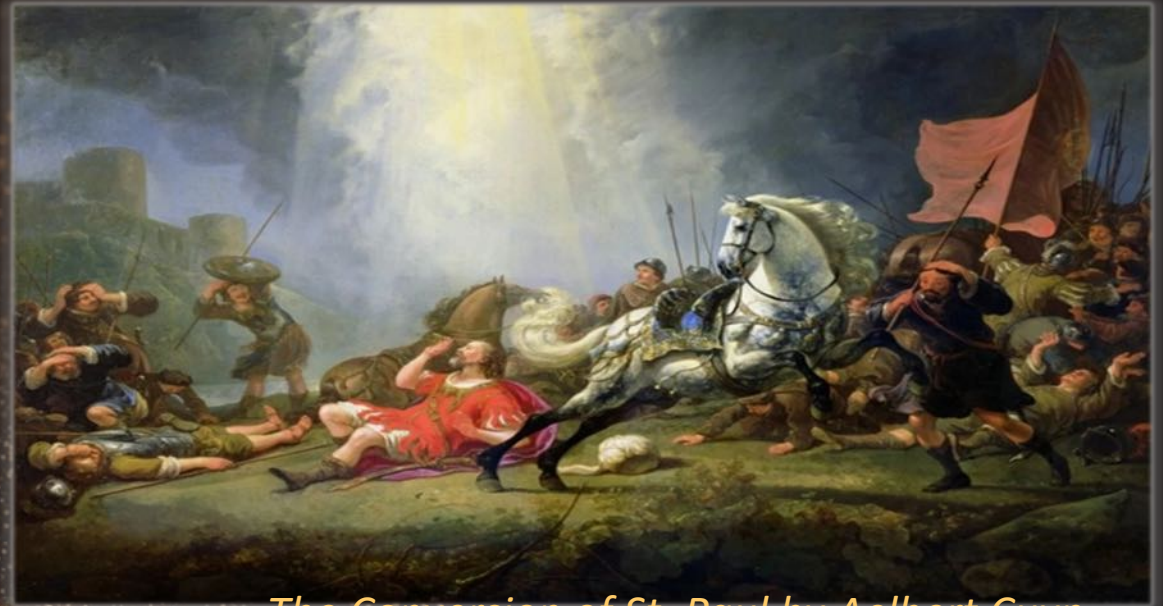
The Conversion of St. Paul by Aelbert Cuyp